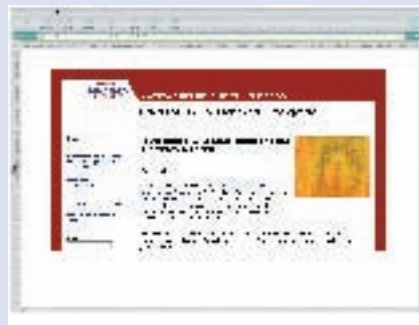
Oxford Brookes University: Gifted and talented Professional Development

various fun and stimulating courses for G&T students in a wide range of topics not usually covered in schools.